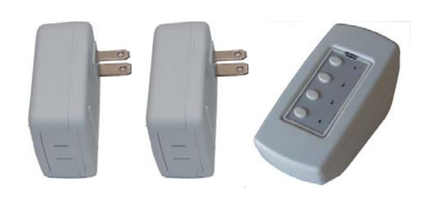
Lamp Starter Kit (PN: DKIT-02) Includes 2 lamp modules and tabletop controller with 4-button scene control

Important Note: only one of each pre-configured accessory PN can be ordered per home installation.